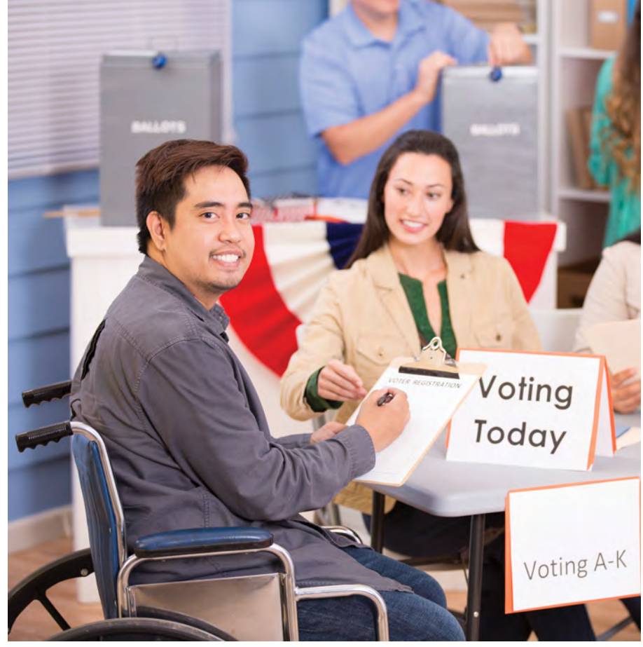
VOTING: IT'S YOUR RIGHT

You can learn more about early voting, including your county's early polling locations and hours on the Division of Elections' Voter Information Portal: https://www.nj.gov/ state/elections/vote. shtml