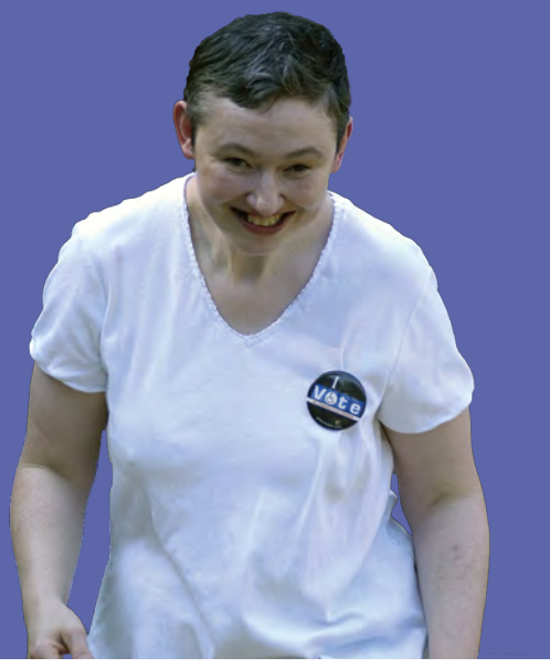
VOTING: IT'S YOUR RIGHT

You must register at least 21 days before the election after living in the same county for 30 days.